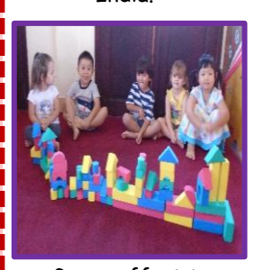
Group effort to build our own Red Room Wat like they did in Cambodia.